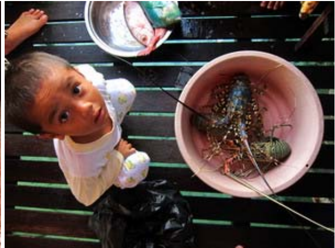
Many types of Grouper / Lobster each Rm50-60

Day 4 Miso Walai Homestay & Kinabatangan River Cruise: We go by Express Bus 730AM 3.5hr to Batu Putih Village, located on the Kinabatangan River. Under WWF sponsored Mescot (Model Ecologically Sustainable Community Tourism Project) , we homestay in the local village houses, experiencing the way of life of the Orang Sungai. Here we also go on a 2hr river safari into the Kinabatangan Forest Reserve to view the famous proboscis monkeys and other wildlife.