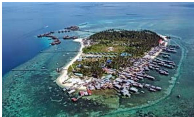
Kapalai Atoll / Mabul Island

This is a snorkeling trip to enjoy three beautiful islands of Mabul, Kapalai, Timba Timba & Matakings. Note that accommodation in Mabul Island is in simple guesthouse that includes lunch, dinner and breakfast.